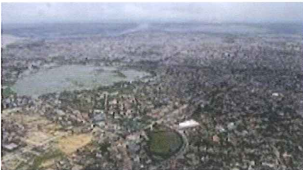
Phnom Penh — Mekong River in top left

This is a story about one of my experiences from when I lived and worked in Cambodia in 1993/94. It highlights what a great reputation we have as Australians helping those in need.