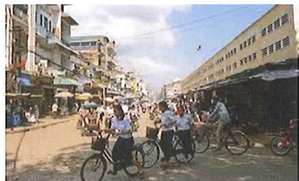
Phnom Penh—Typical Street Scene