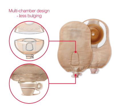
Soft touch tap - comfort and ease of use