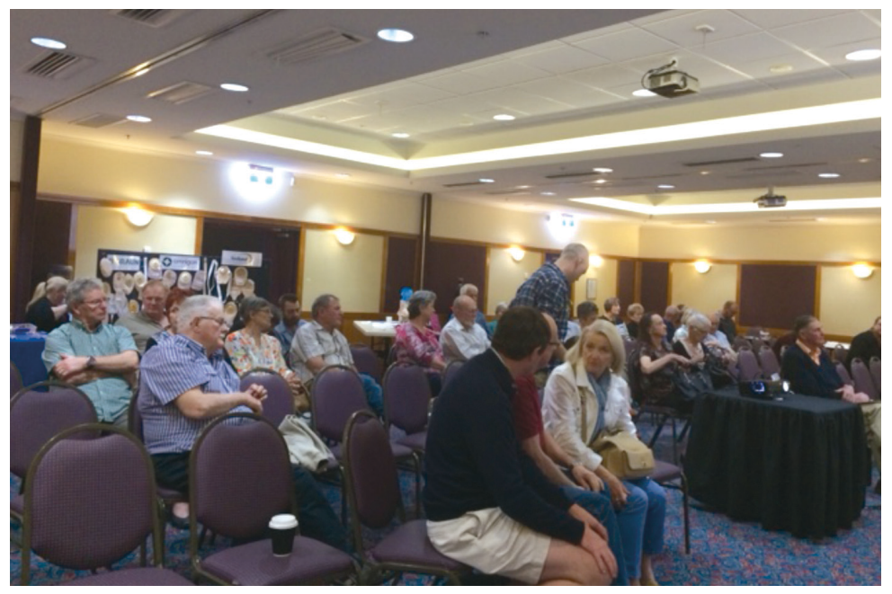
Members met in Dubbo for an Education Day.